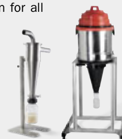
High-performance Cyclone separator and FRITSCH Cyclone separator

The result: a particularly fast and efficient grinding with minimised thermal load at a significantly higher throughput – and particularly easy and fast cleaning.