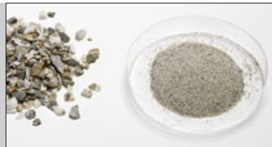
Stones before and after grinding with the Cross Beater Mill PULVERISETTE 16