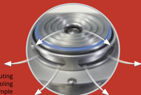
Ingenious air routing for efficient cooling of the sample

Available only from FRITSCH: The ingenious air routing of the PULVERISETTE 14 classic line ensures a constant airflow to cool the rotor, all motor components and the grinding material in the collecting vessel. At the same time, a large fan blows the cooling air into the instrument through a foam particle filter to create positive pressure that prevents the penetration of dirt particles from the ambient air.